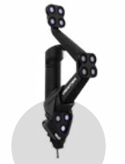
Optional probing capability with HandyPROBE